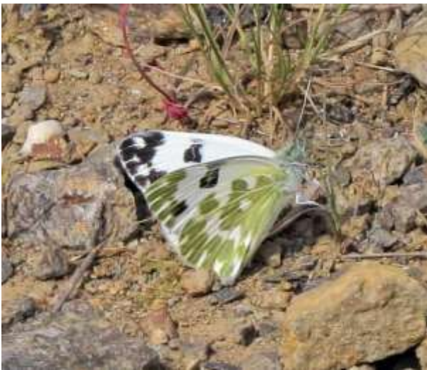
Bath white Pontia daplidice