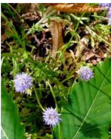
Sheeps-bit scabious Jasione montana