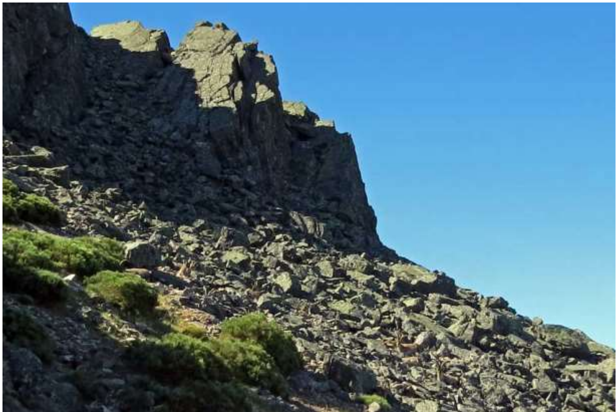
Spanish ibex on scree slopes.