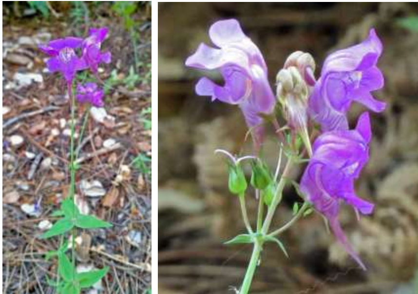
Three bird toadflax Linaria triornithophora

In the valley bottom amongst a variety of ferns, mosses and lichens was a Three bird toadflax Linaria triornithophora . Insects included Beautiful demoiselle Calopteryx virgo flitting around the riverside plants, and the Speckled wood butterfly Pararge aegeria . We also spotted an Algerian sand lizard Psammotrochus algerus .