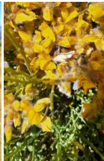
Echinospartum lusitanicum sbsp. Barnadesii