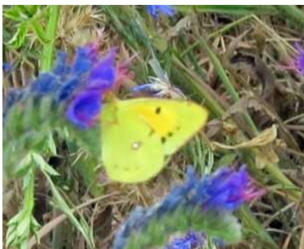
Clouded yellow Colias Crocea