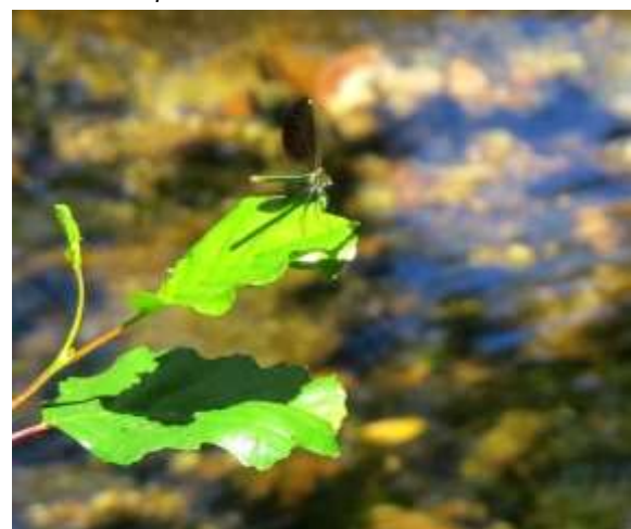
Beautiful demoiselle Calopteryx virgo males left and female right