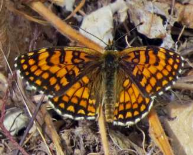
Meadow fritillary Melitaea parthenoides