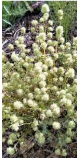
Spanish marjoram Thymus mastichina