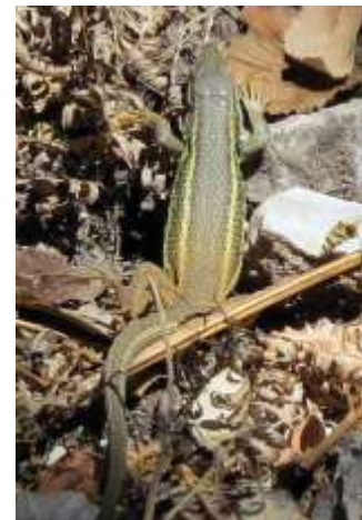
Algerian sand lizard Psammotrochus algerus