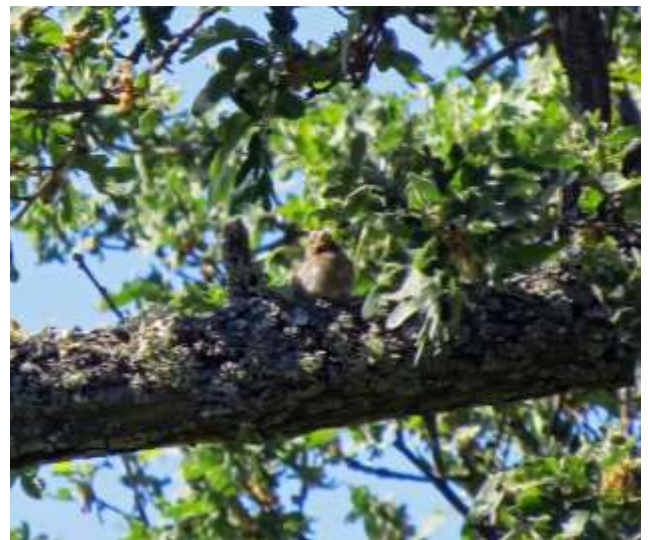
Hawfinch chick waiting for grub