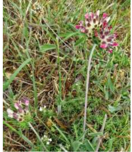
Anthyllis vulneraria subsp. gandogeri