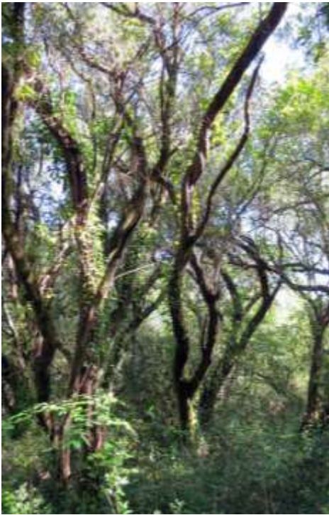
Arbutus unedo forest

In the morning we had a walk in a very old Strawberry tree, Arbutus unedo forest, with Butcher's broom Ruscus aculeatus and Sweet chestnut. Here we saw Golden oriole as well as hearing many small birds. We then visited the medieval walled village of Miranda del Castañar, where we saw Redstart, Black redstart, Swift, Barn swallow, Crag martin and Booted eagle.