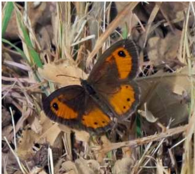
Spanish gatekeeper Pyronia Bathsheba