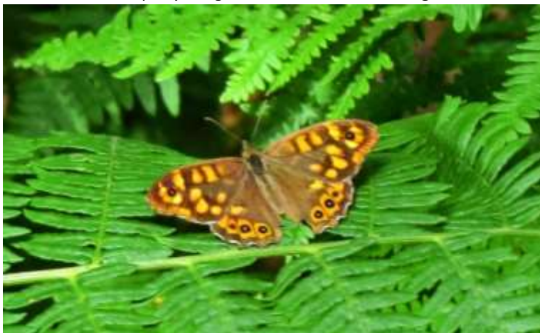
Speckled wood butterfly Pararge aegeria