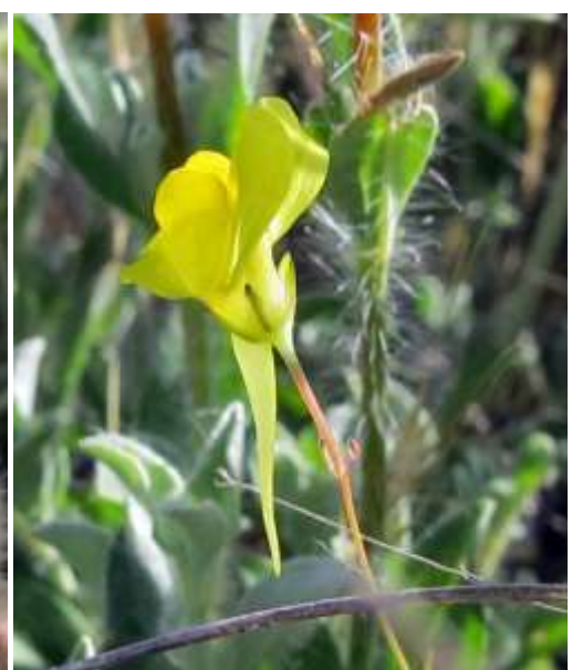
flower beetle Mylabris hieracii