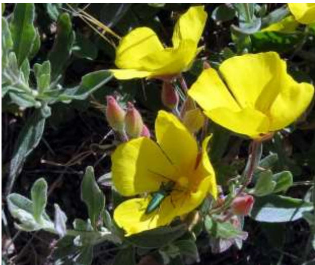
Yellow rockrose Halimium lasianthum

After coffee we drove across to the Portillo mountain pass, stopping off at the view points on the way to the Batuecas river valley. Here there was lots more Yellow rockrose Halimium lasianthum , one with a slim green metallic beetle, possibly the Musk beetle Aromia moschata , a very green Cucumber spider Araniella cucurbitina and a lovely new plant for me: Snowy toadflax Linaria nivea .