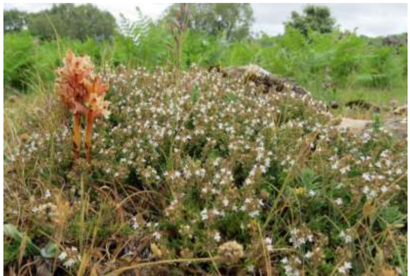
Orobanche alba with Thymus vulgaris