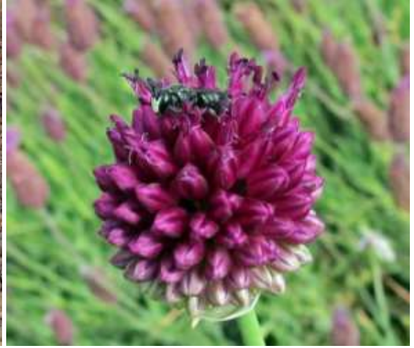
Allium sphaerocephalon with Hylaeus hyalinatus