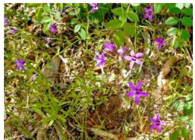
Spreading bellflower Campanula patula