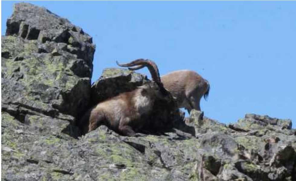
Older male Spanish ibex

At the top were Swift, Pallid swift and Crag martin, Black redstart, Linnet, Serin, Northern wheatear, Raven and Dunnock, and we all got good views of Blue rock thrush, adults and chick. I saw Rock bunting but it quickly disappeared behind some rocks, and Alfonso also caught a glimpse of Red rock thrush but it eluded the rest of us. There were great views of Griffon vultures soaring below us from here, and more Spanish Ibex looking like sculptures behind the monastery buildings.