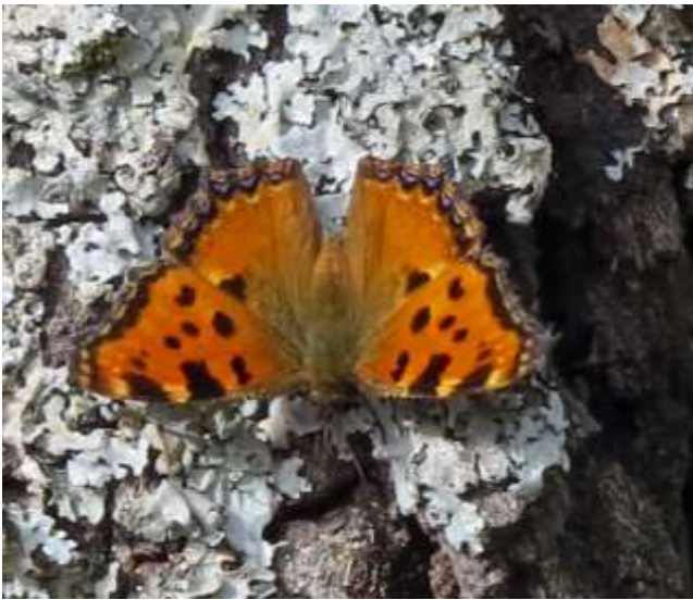
Large tortoiseshell Nymphalis polychloros

We began the day looking around the grounds of the Hotel Rural Porta Coeli, and the hillside above the hotel. Nightingale, Serin, Cirl bunting and Greenfinch all made an appearance, with the Golden Oriole heard but not seen, and Griffon vulture in the skies. There was Large tortoiseshell Nymphalis polychloros , Spanish gatekeeper Pyronia Bathsheba , Meadow fritillary Melitaea parthenoides , Small copper Lycaena phlaes , Bath white Pontia daplidice , Clouded yellow Colias Crocea and an unidentified Skipper.