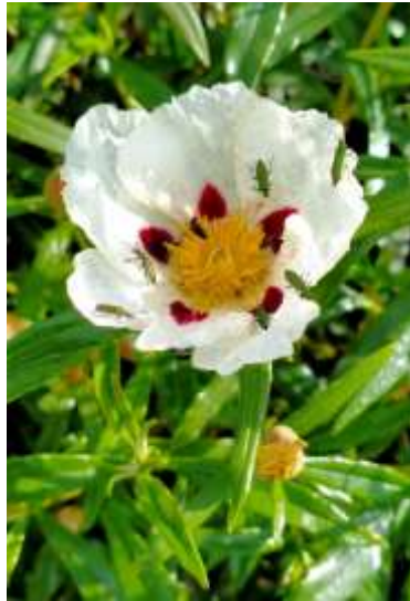
Gum cistus Cistus ladanifer