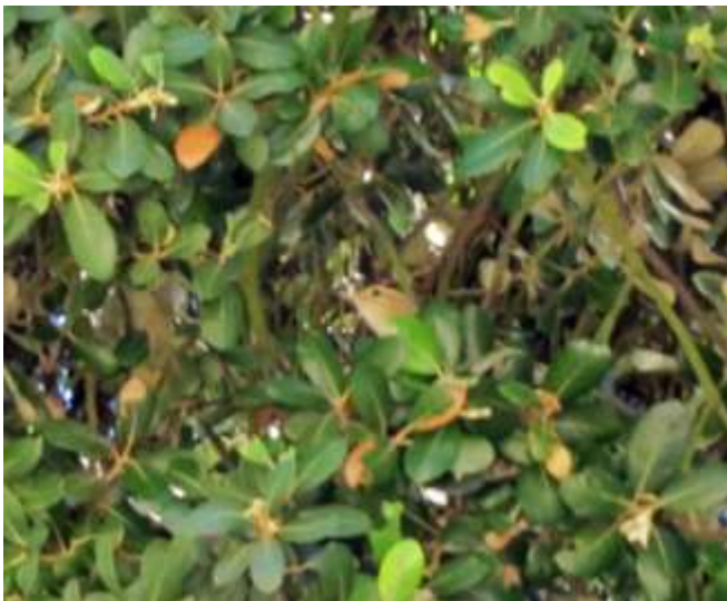
Western Bonelli's warbler peeps from Holm oak

Here it was quite hot so we tried to keep to the shade and noticed that the birds were also avoiding being out in the sun. We did however see Swifts, Barn swallow, Crag martin, Rock sparrow, Golden Oriole, Iberian magpie, Melodious warbler, Serin, Western Bonelli's warbler, Bee-eater and Linnet, with the background music of Blackcap and Nightingale. A Hawfinch appeared in the trees above us, and flew onto a branch where we were all able to see its chick awaiting a meal. Raptors included Booted eagle, Red kite and Griffon vulture.