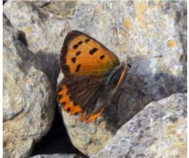
Small copper Lycaena phlaes