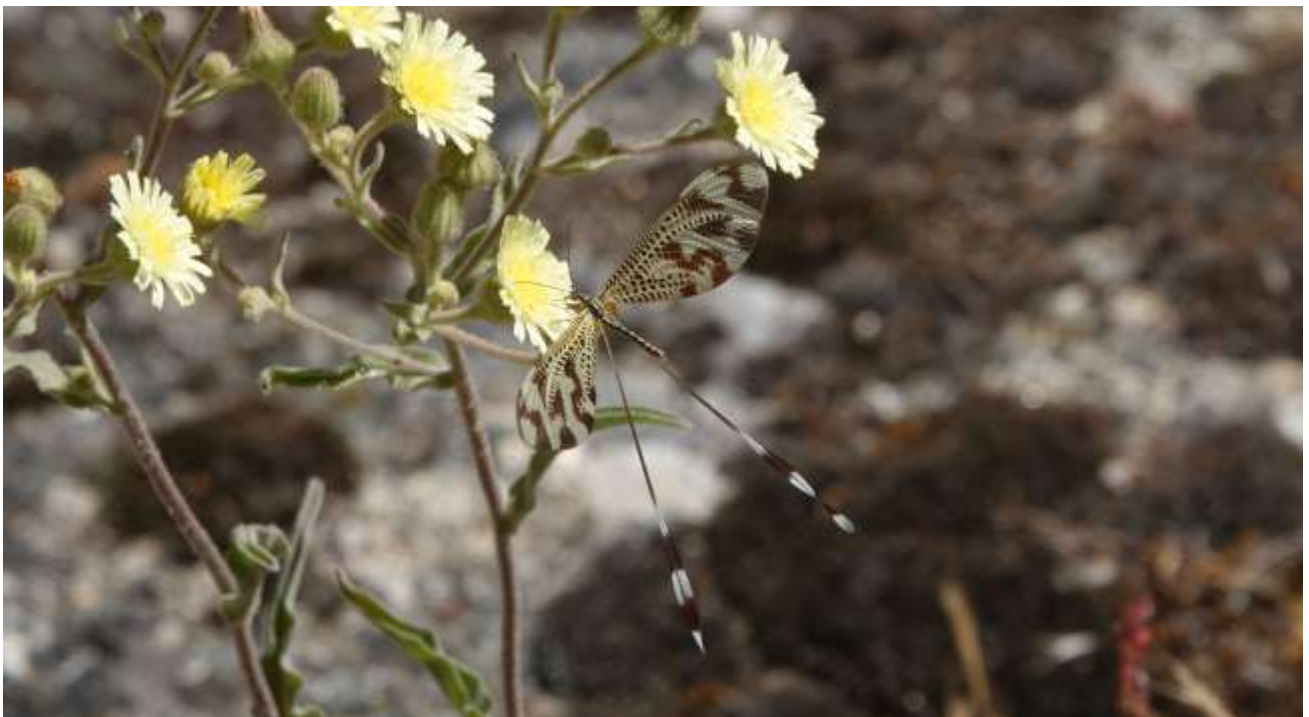
Nemoptera bipennis